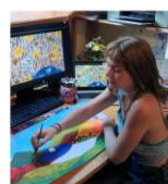
FREELANCE ILLUSTRATOR AND ARTIST BASED IN WORCESTERSHIRE