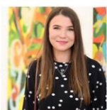
ARTIST AND GALLERY CURATOR