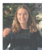
FORMER EDITOR NOW WORKING A LONDON GALLERY