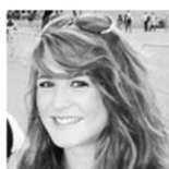
AGENCY OWNER & 2-D CREATIVE DIRECTOR

A BRIEF INSIGHT: FORMER STUDENTS AND WHAT THEY ARE DOING NOW!!