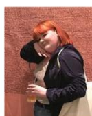
GALLERY WORKER & RUNS ART WORKSHOPS