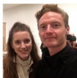
GALLERY CURATOR & FASHION STYLIST