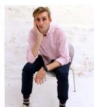
GRAPHIC DESIGNER GLASGOW